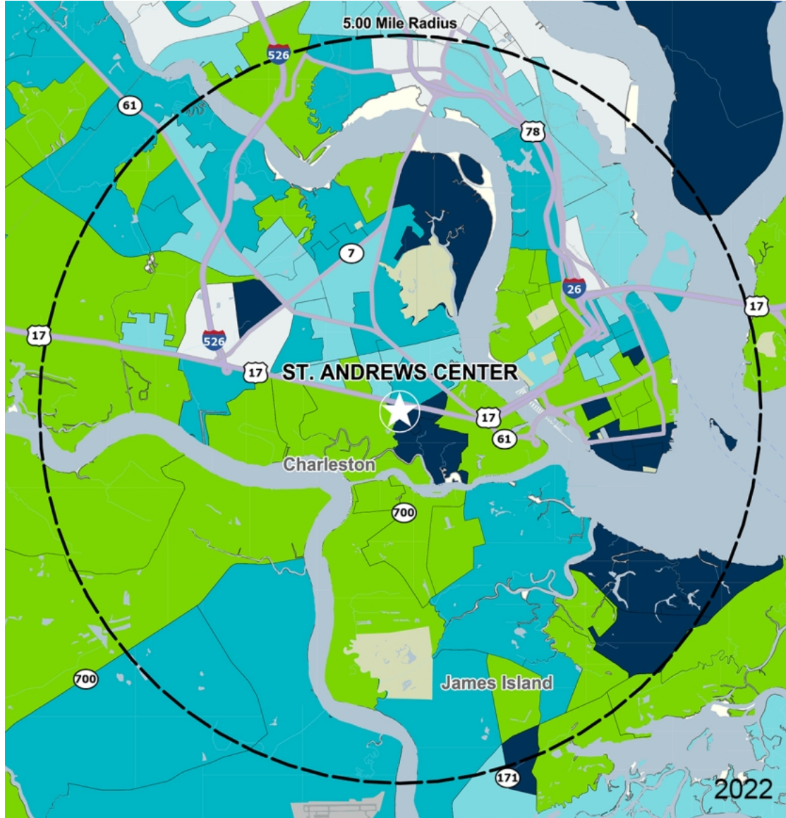
by Block Group