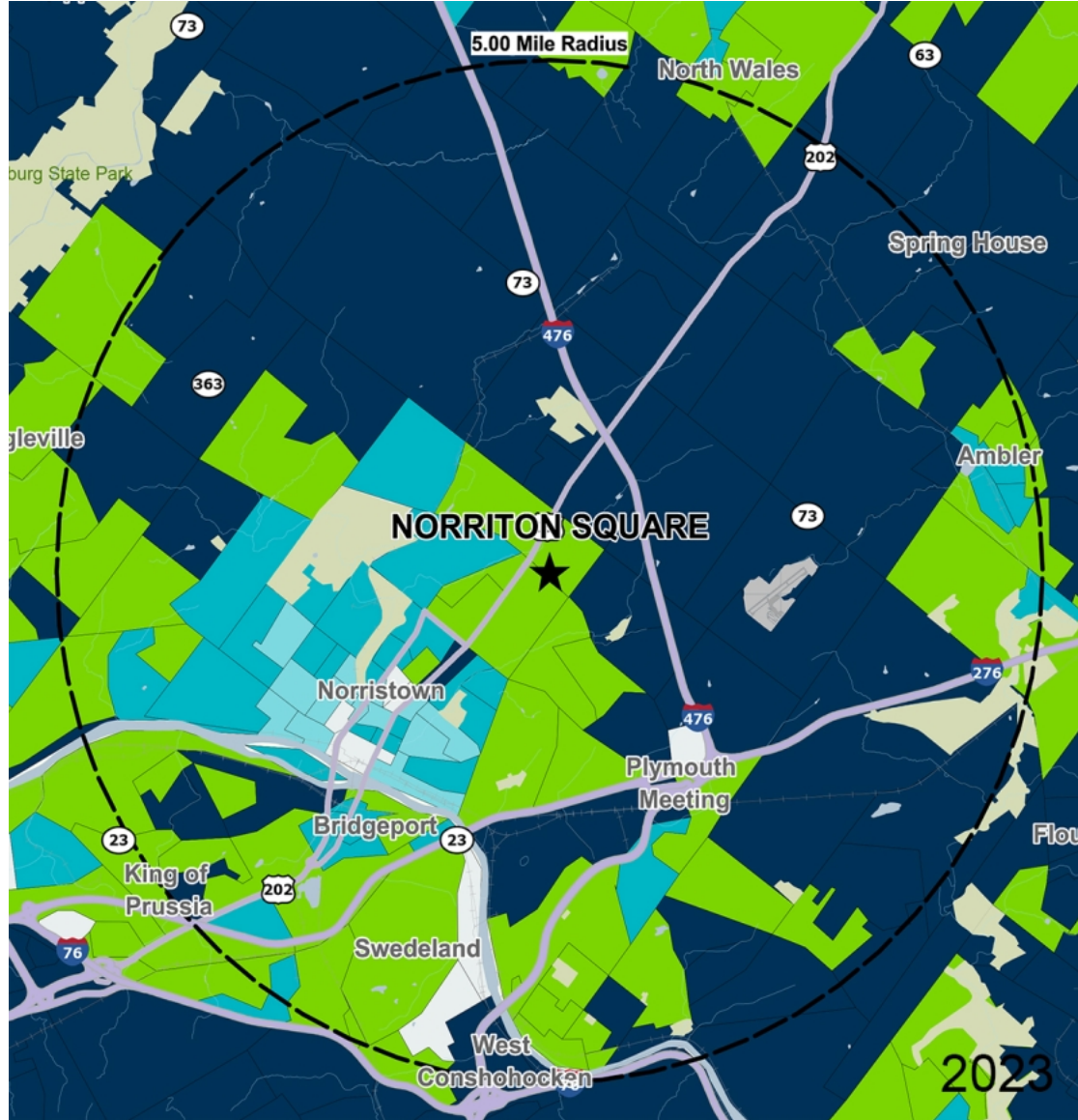
by Block Group