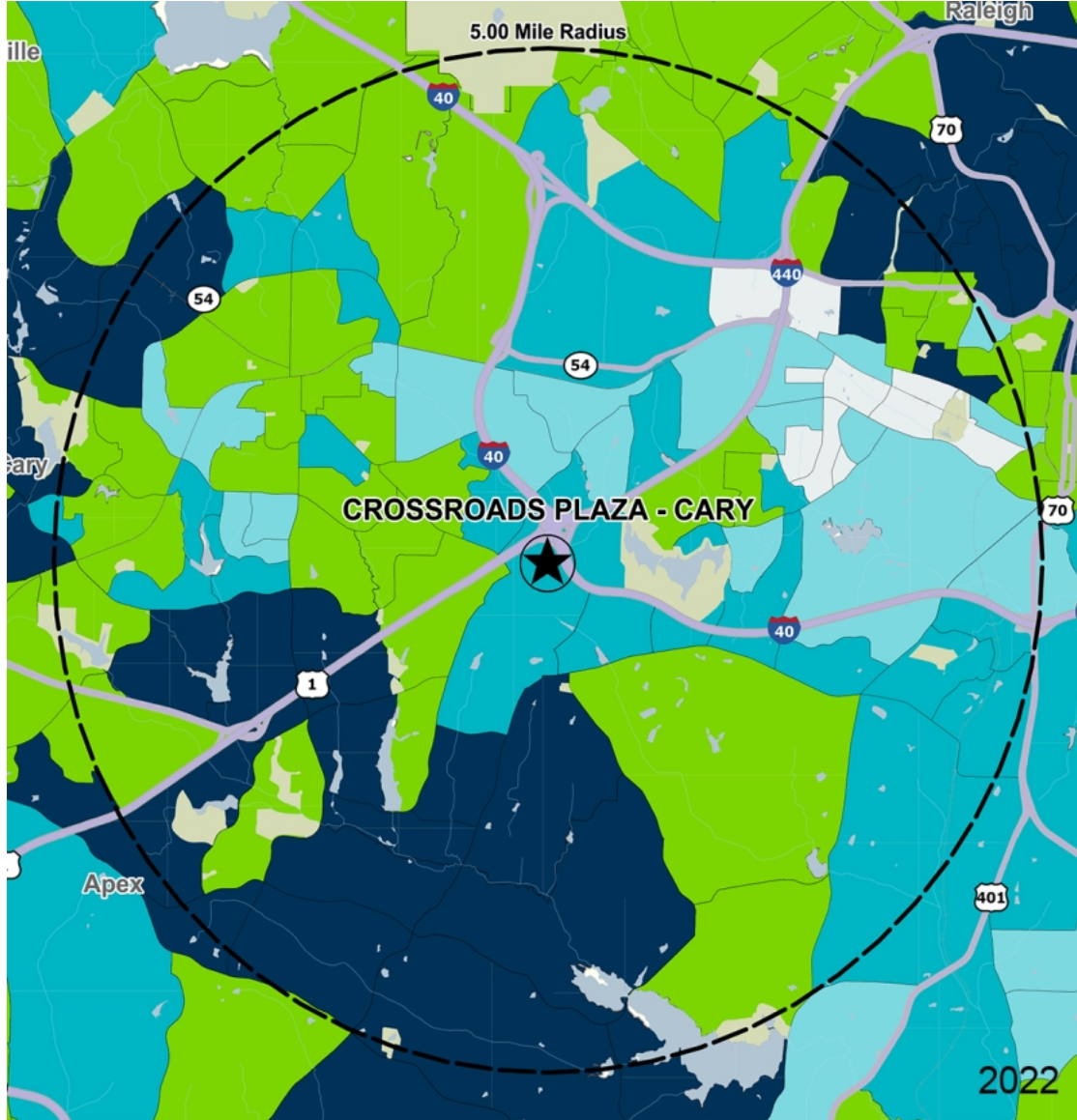
by Block Group