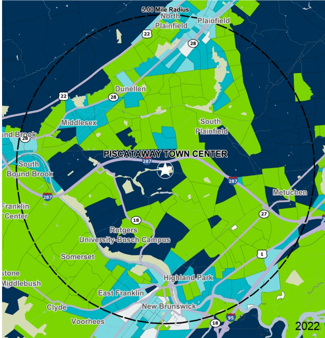
by Block Group