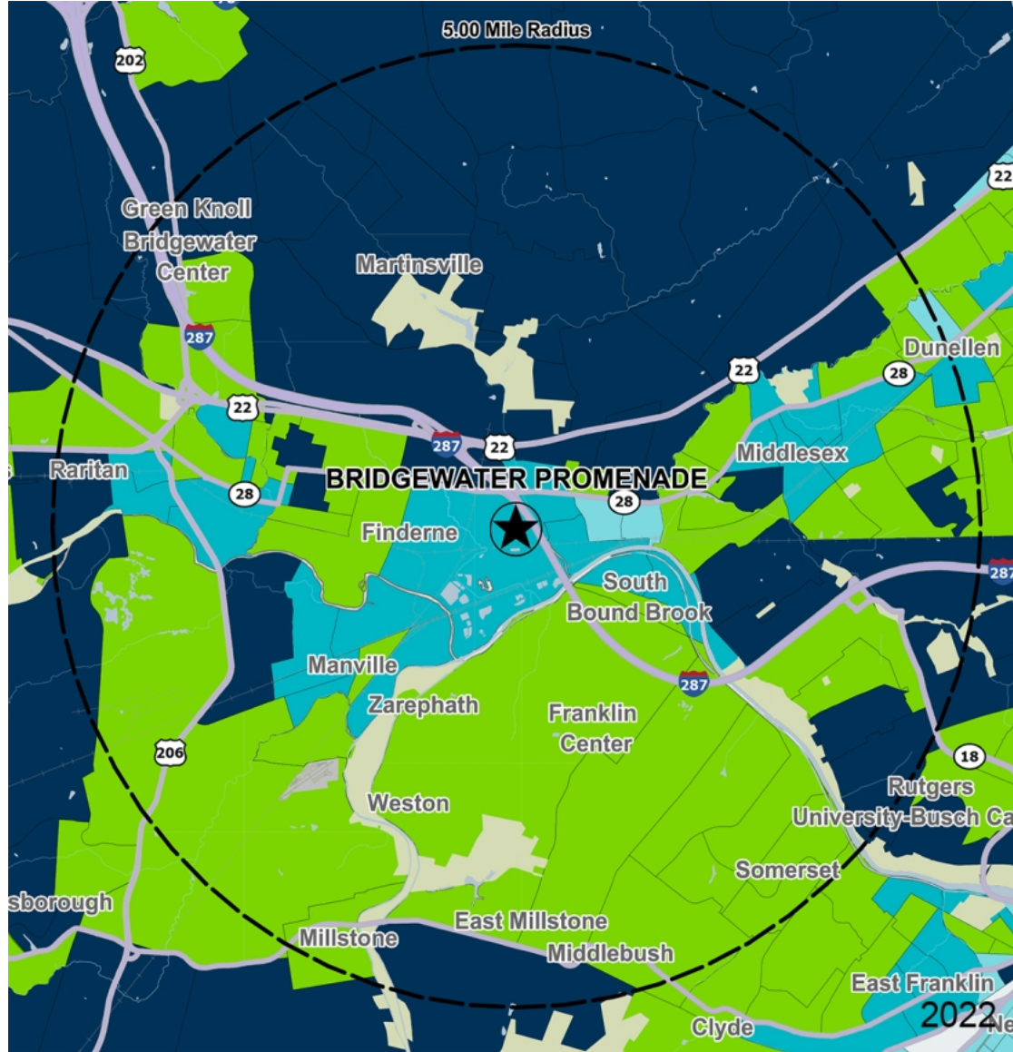
by Block Group