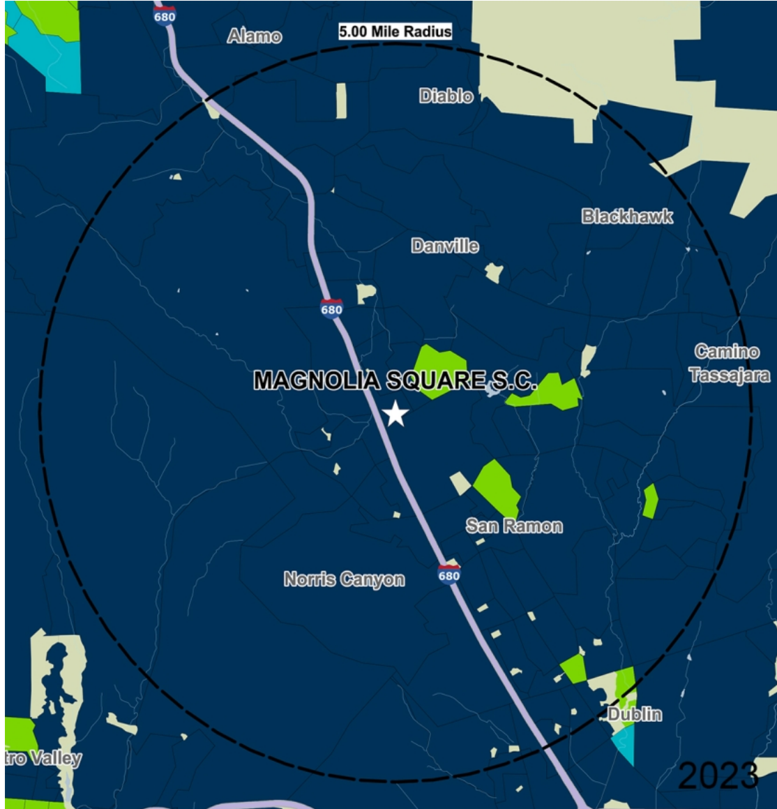
by Block Group