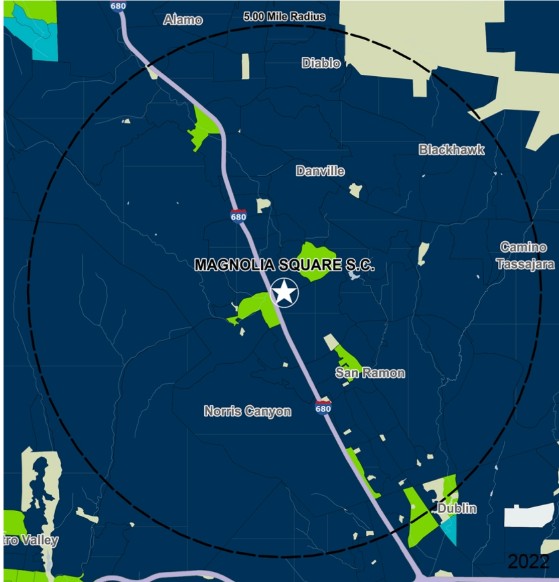
by Block Group