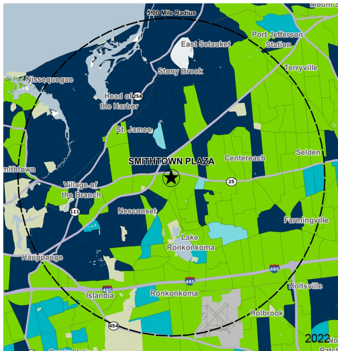
by Block Group