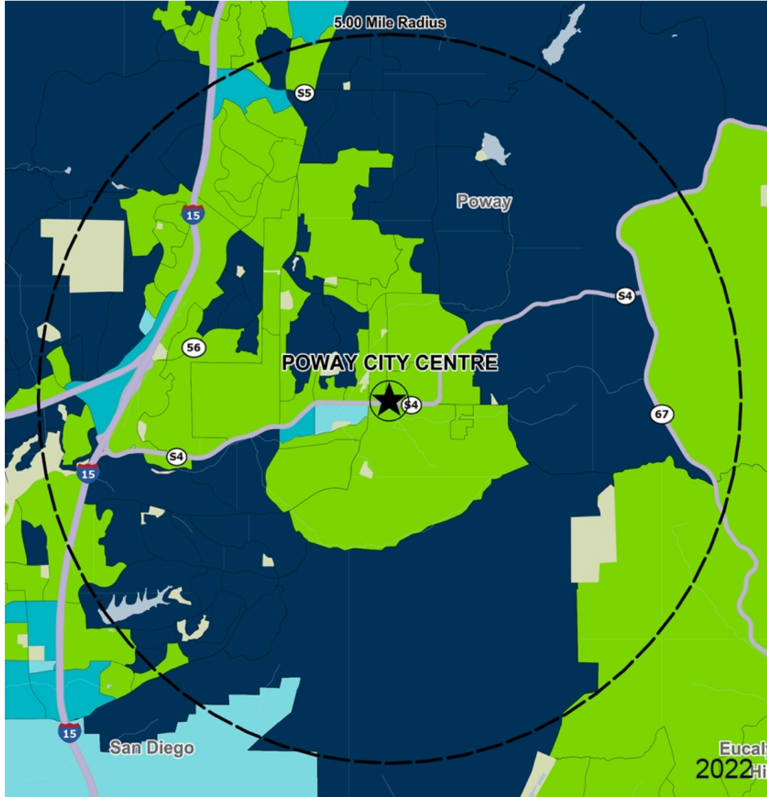
by Block Group