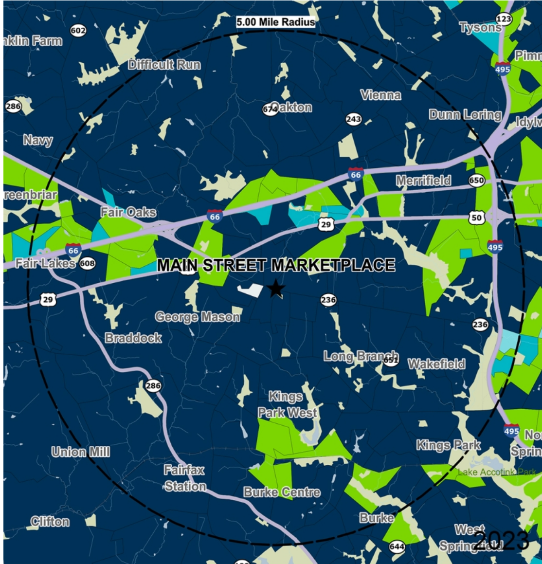
by Block Group