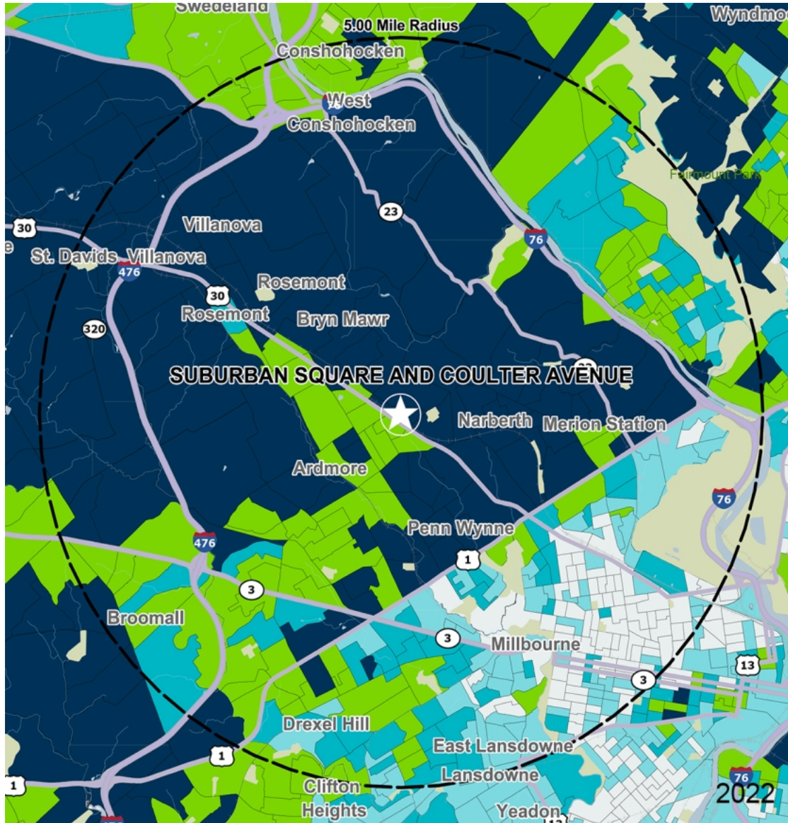
by Block Group