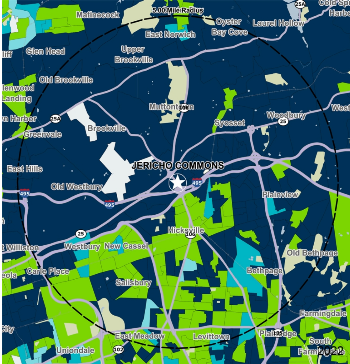
by Block Group