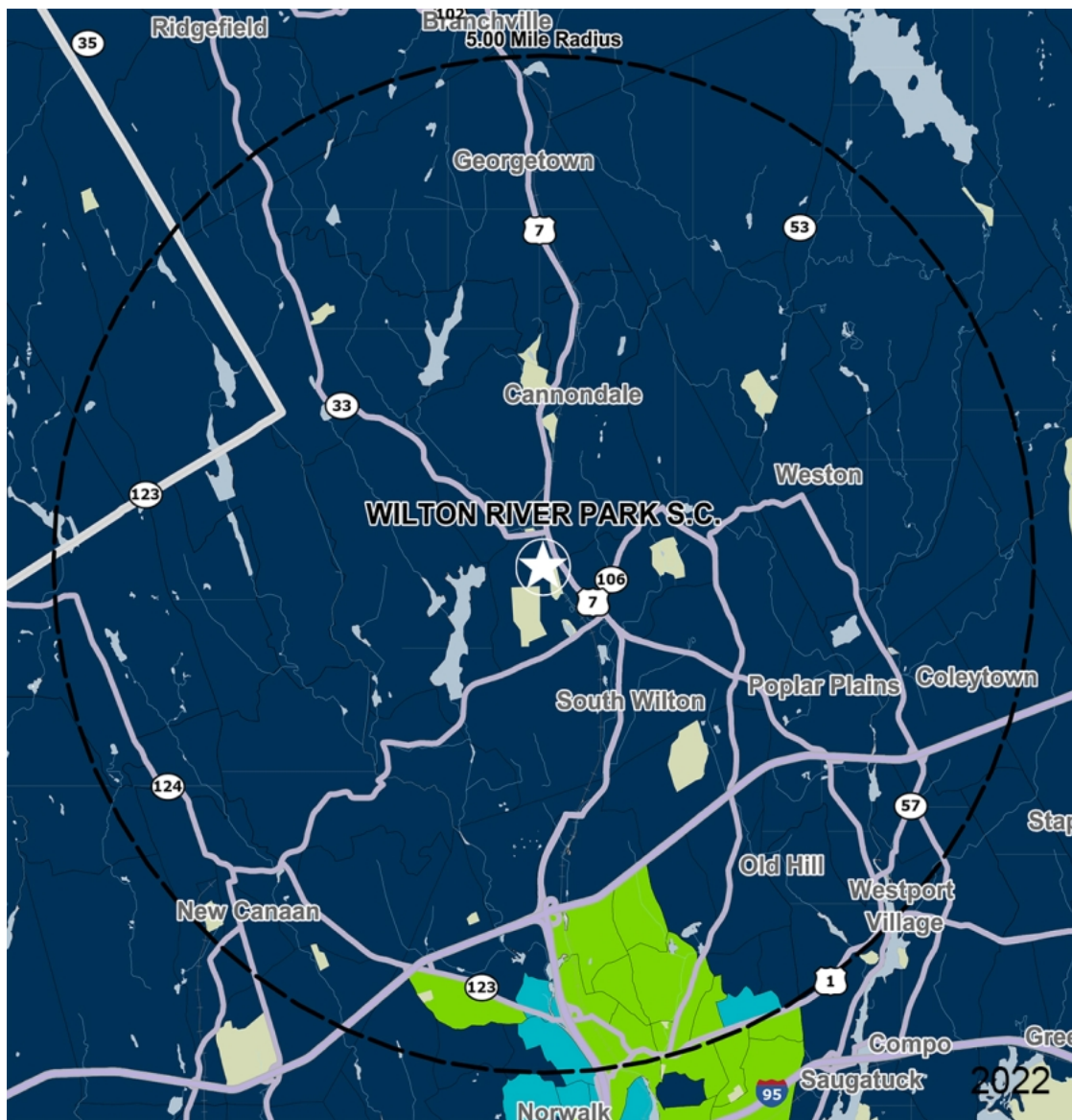
by Block Group