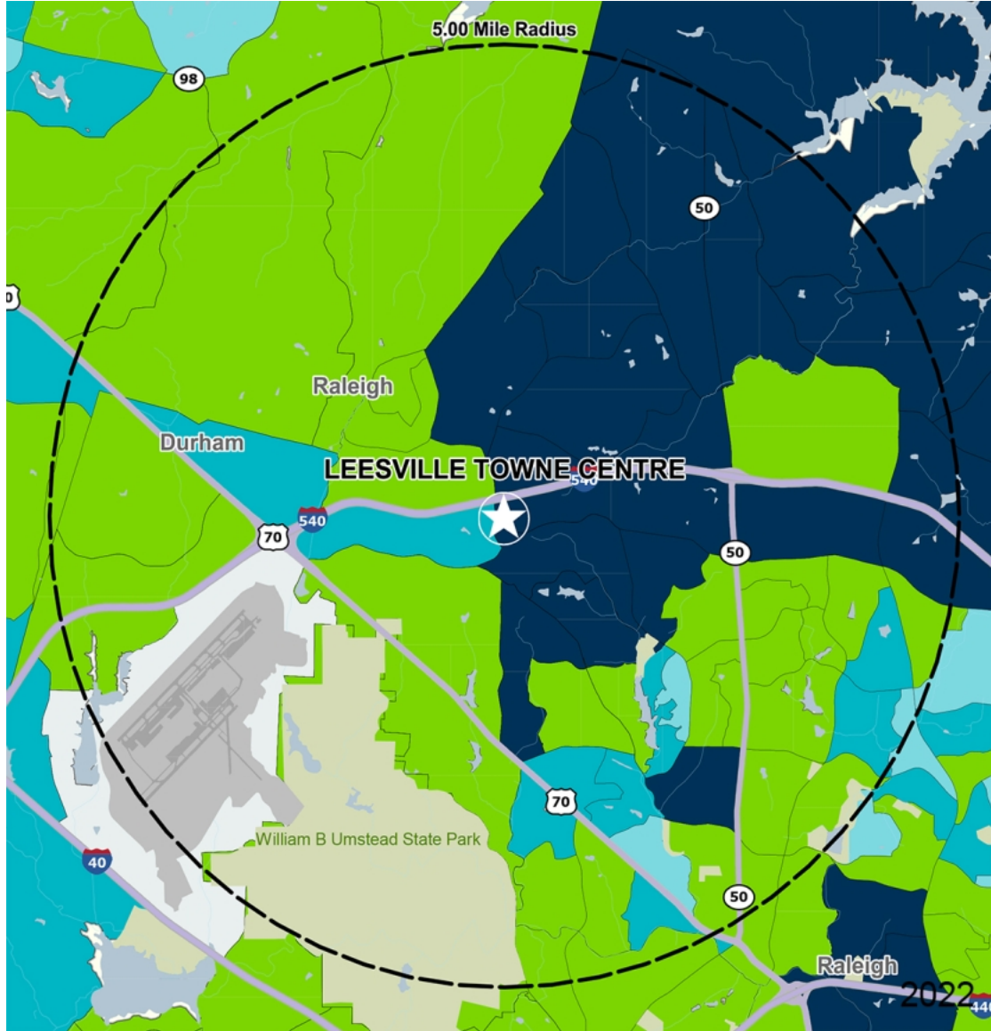
by Block Group