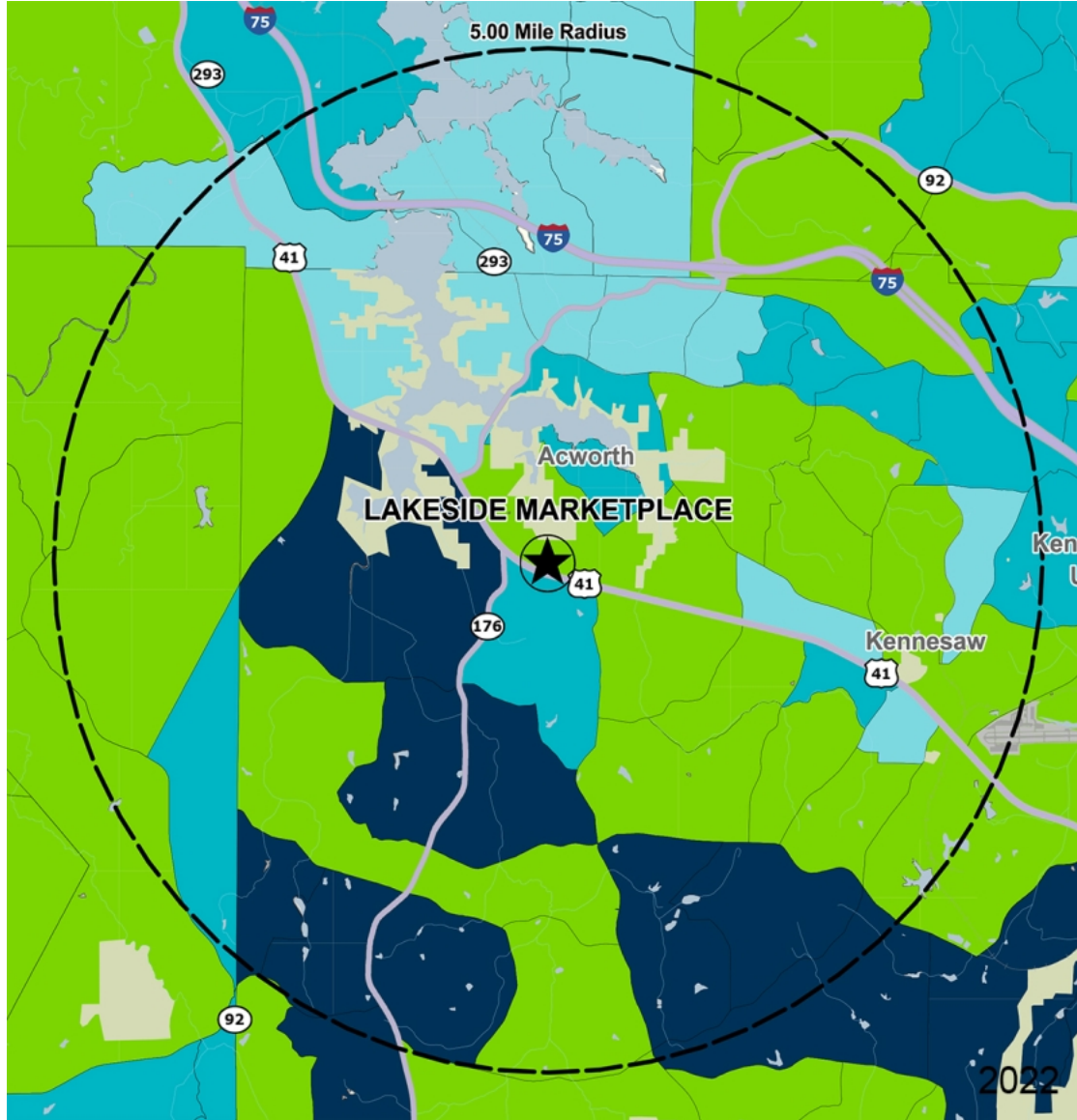
by Block Group