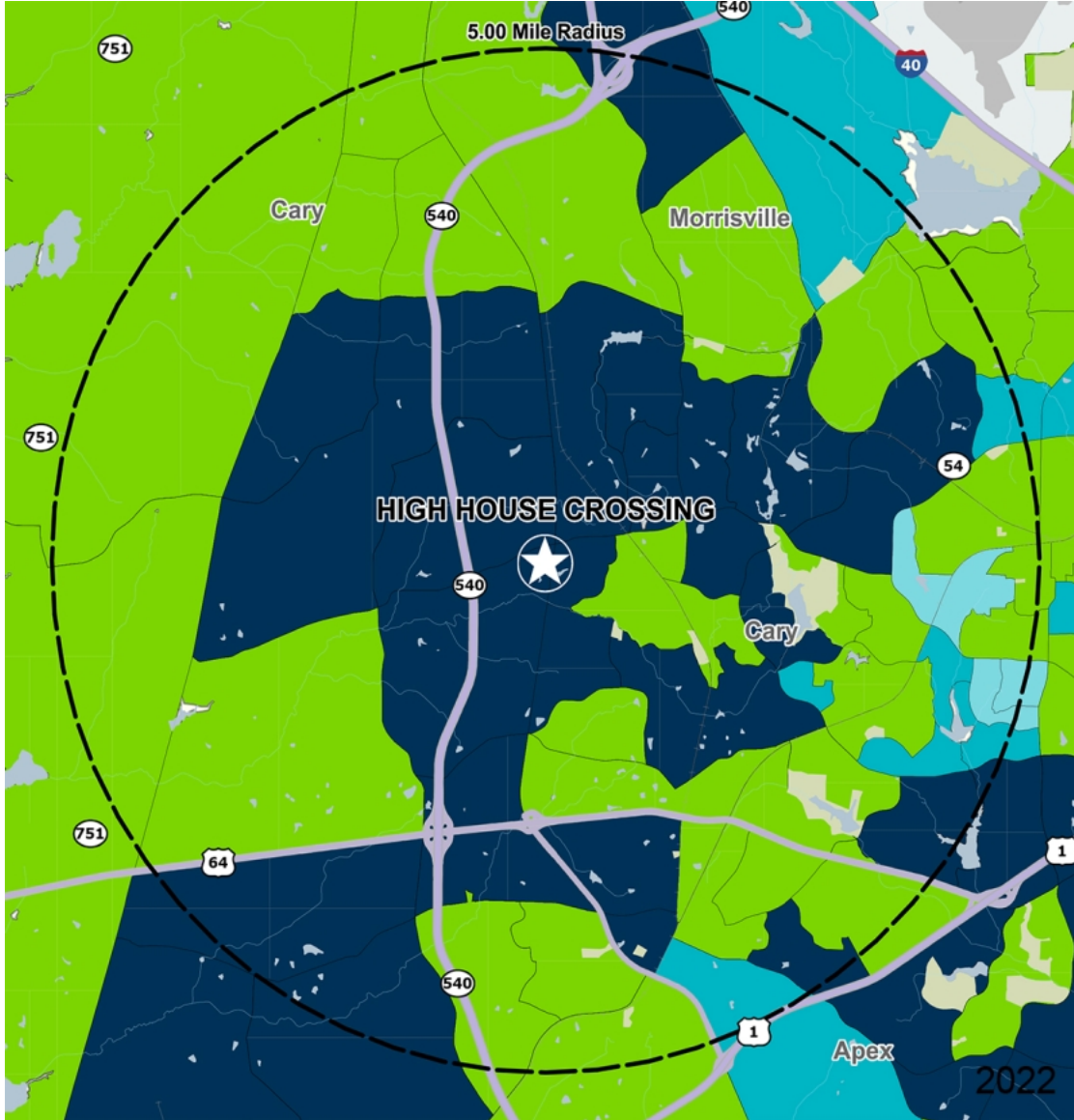
by Block Group