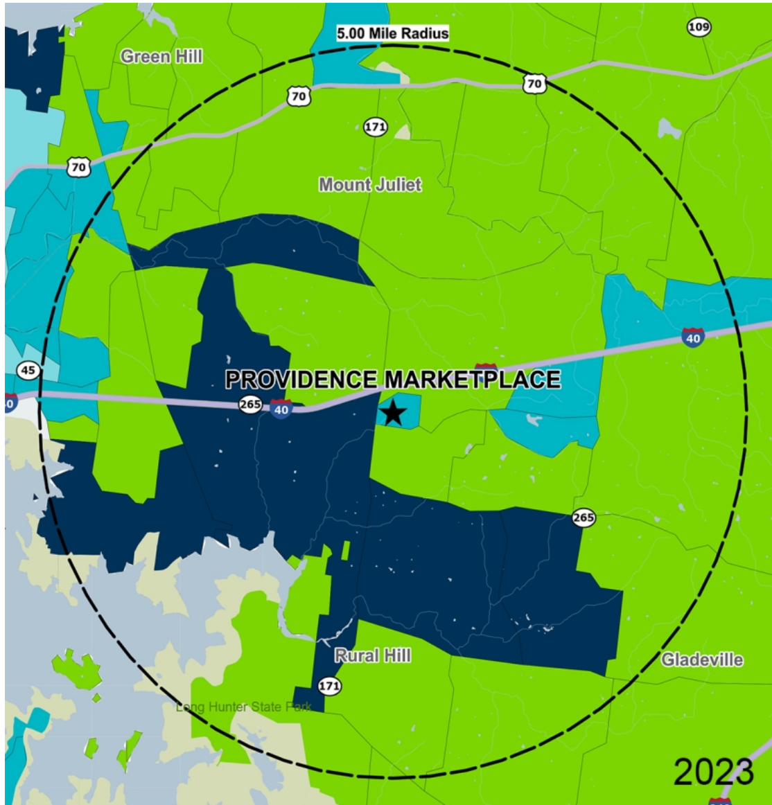
by Block Group