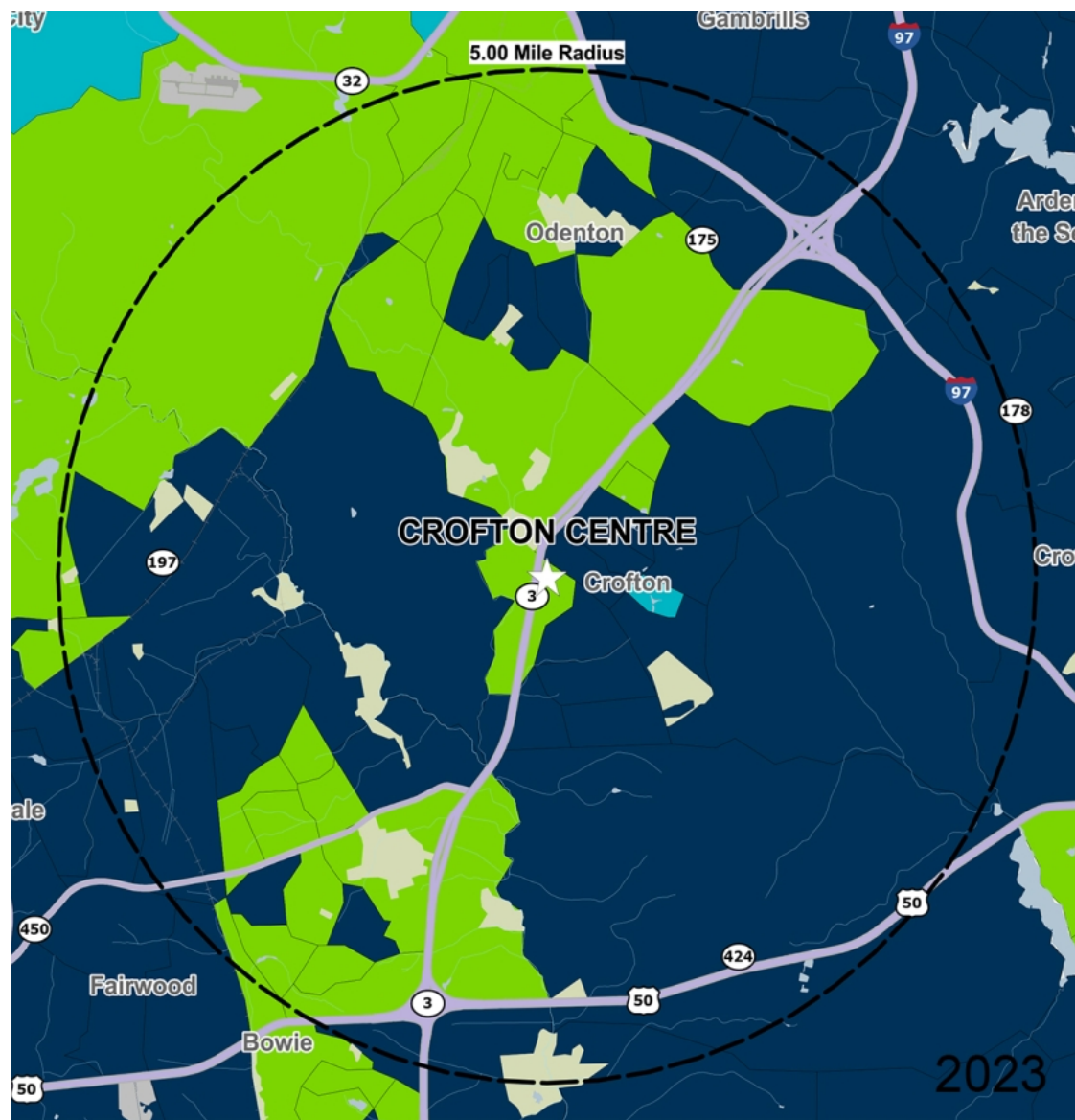
by Block Group