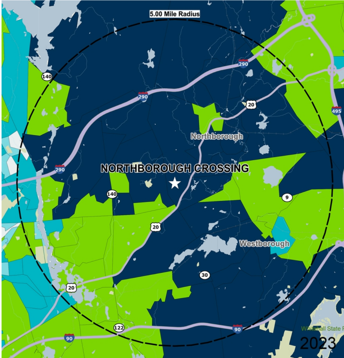
by Block Group