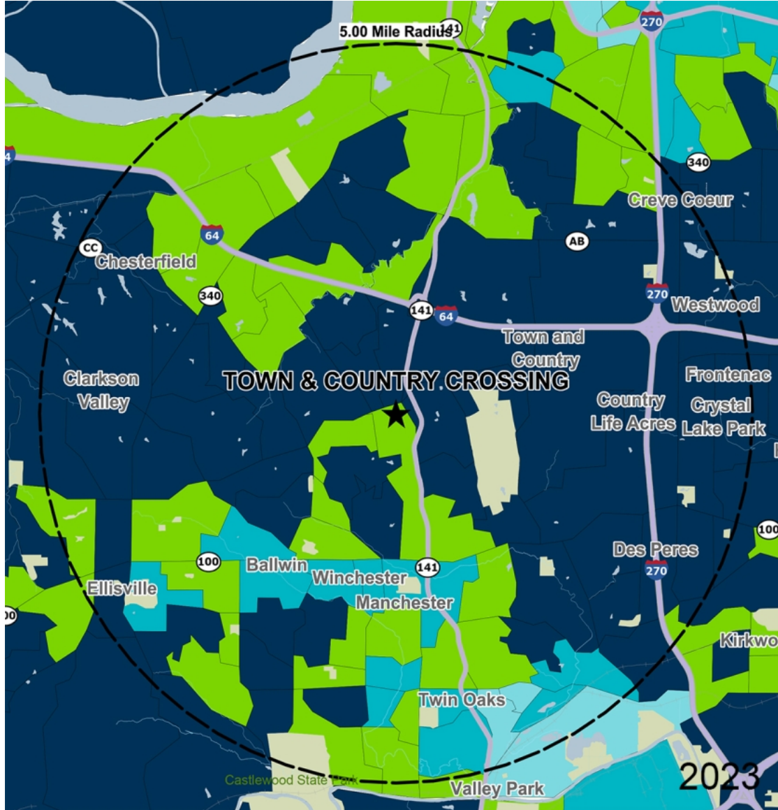
by Block Group